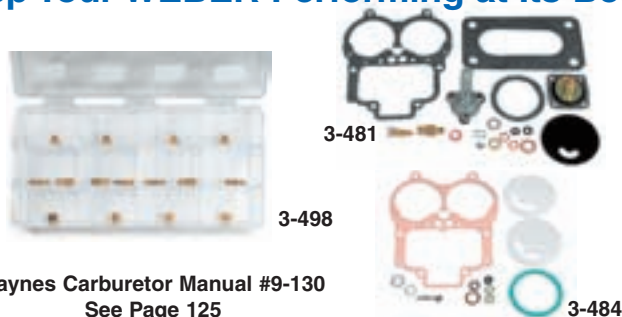
Haynes Carburetor Manual #9-130 See Page 125

DGV Jet Assortment Kit - Includes 12 assorted jets to fine tune your DGV. Includes main jets, air corrector jets and idle jets in various sizes.